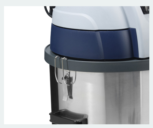
Locking mechanisms are designed for single handed use

VL100 is fully compatible with the range of accessories offered with the rest of the Nilfisk Dry canister vac portfolio, allowing easy interchangeability and reducing the overall operating costs of your complete Nilfisk cleaning solution. A good and reliable choice for contract cleaners, institutions, hospitality and retail.