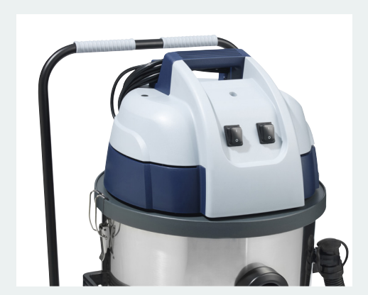
Dual or single motor