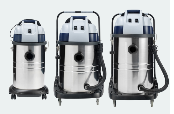
Available in 3 different sizes: 35 ltr., 55 ltr. and 75 ltr.

Specifications and details are subject to change without prior notice.