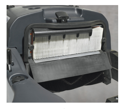
Thanks to the polyester filter the SW 750 can be used in both dry and humid areas.