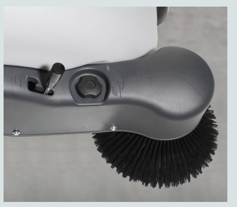
The main and side brushes are adjustable to ensure perfect pressure on the floor at all times and in all conditions.