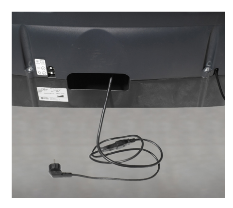
The plug-in onboard battery charger ensures continuous and hassle-free operation.