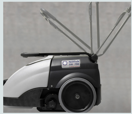
The handle is fully adjustable to suit each individual operator. It folds down completely to simplify storage.