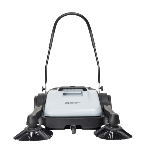
SW200 with one side broom – and SW250 with two side brooms – cover working widths of 70 cm and 90 cm.