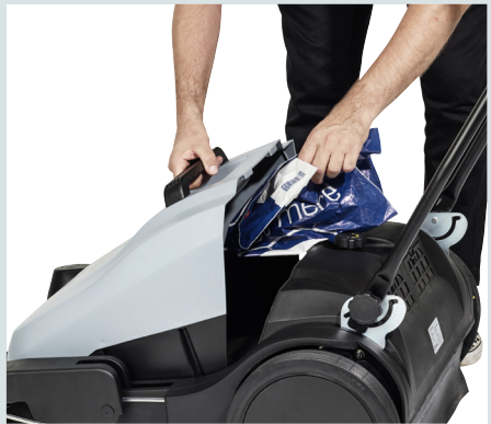
The hopper can stay in open position so it is easy to throw big items or empty a garbage bin into the hopper