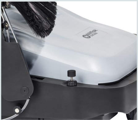
Both the main broom and the side brooms can be adjusted without using tools