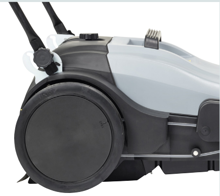
The handle can be adjusted to fit the operator height (3 positions)